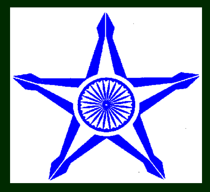
LOK SATTA People Power